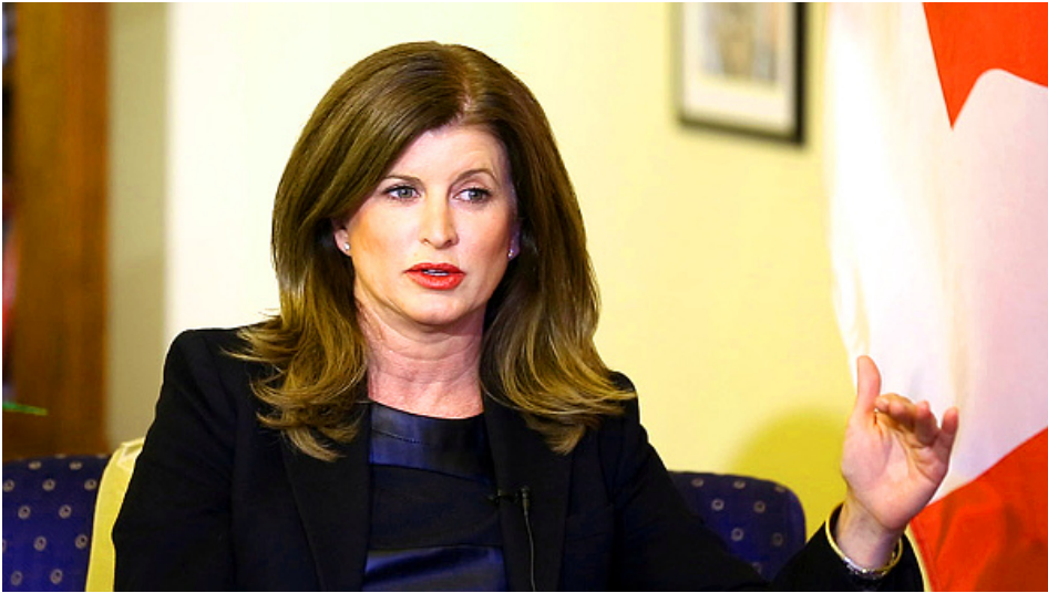
Rona Ambrose.